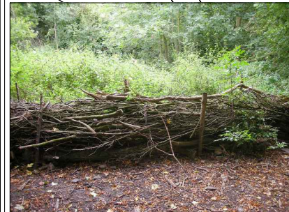
Examples of 'dead hedges'