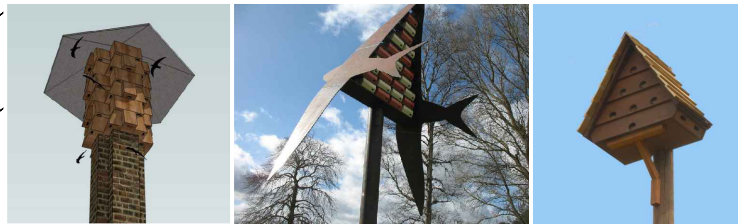
Examples of Swift Towers The design of this could be run as a competition